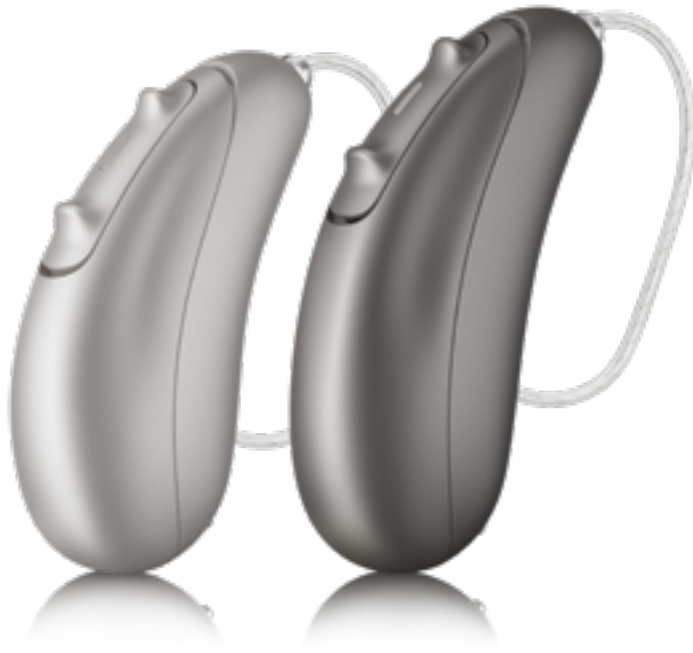
Moxi Vivante R